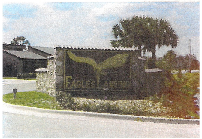
The entry way as it looked when completed in July of 1986. Note the stucco wall which extended westward to the wet-lands

The same year a 60-foot extension at the west end of the brick wall was completed. The irrigation system was expanded to all homes on Osprey Drive that were without sprinklers. In 1997 the streets were repaved and the spruced-up entry way into the sub-division was completed. Eagle's Landing looked essentially as it does today.