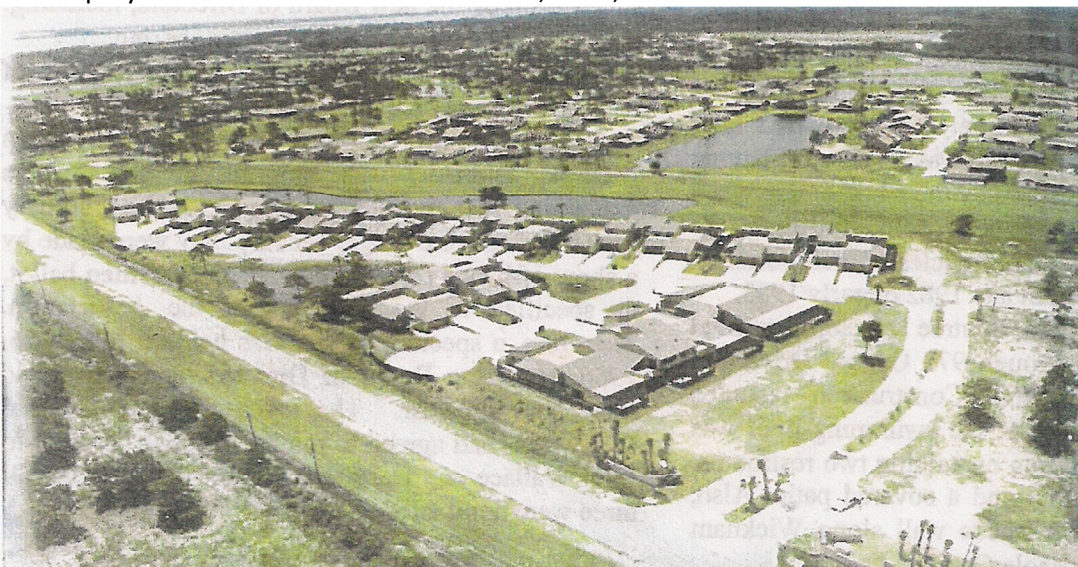
Eagle's Landing at Suntree, July 24, 1982. Wickham Road at bottom, 14 th fairway across the center of picture.

*Note: Roof maintenance was listed in the Covenants as the responsibility of the Association.